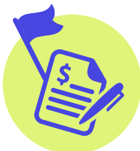
CONTRACT SCAVENGER HUNT!