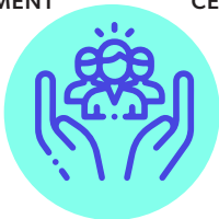
TRAUMA-INFORMED/ RESTORATIVE APPROACHES