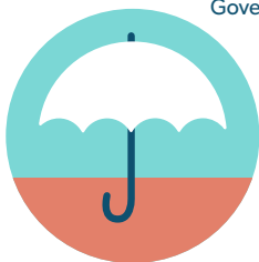
WORKERS' COMPENSATION Governor, General Assembly, Congress