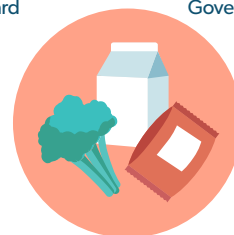
DUTY-FREE LUNCH Local Board of Ed, Your Union