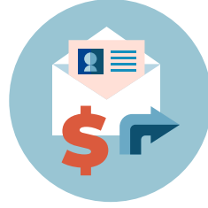
RETIREMENT BENEFITS & PENSIONS Governor, General Assembly, Pension System Board