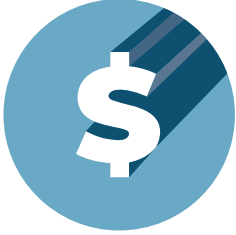
YOUR SALARY Local Board of Ed, Your Union