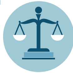
DUE PROCESS Local Board of Ed, State Board of Ed, Governor, General Assembly