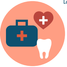
HEALTH/DENTAL INSURANCE Local Board of Ed, Your Union