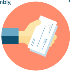
UNEMPLOYMENT COMPENSATION Governor, General Assembly, Congress