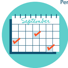
SCHOOL CALENDAR Local Board of Ed