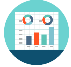
SCHOOL BUDGET Local Board of Ed, County Officials, Governor, General Assembly