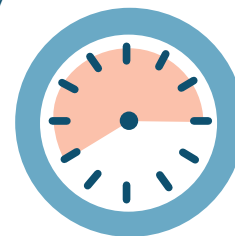
LENGTH OF WORKDAY Local Board of Ed, Your Union