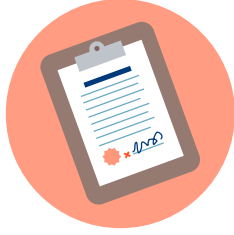
YOUR UNION CONTRACT Local Board of Ed, Your Union