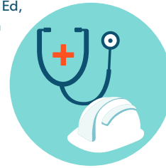
HEALTH AND SAFETY STANDARDS Governor, General Assembly, Congress